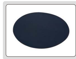
silicon carbide paper (optional)