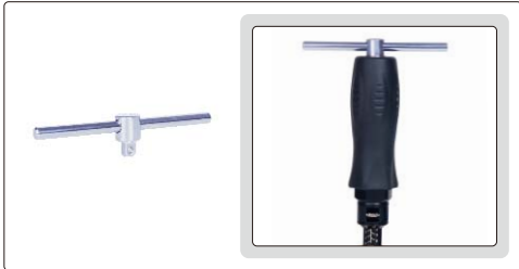
T-bar wrench (optional)

■ According to DIN ISO 6789, ASME B107.300-2010