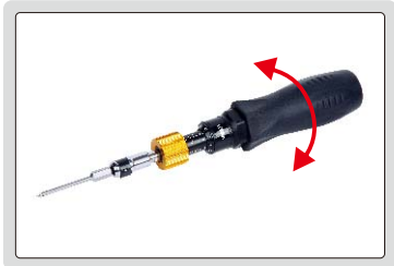
step 2: rotate the handle to set torque