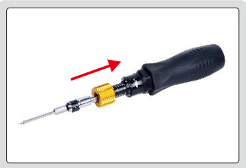
step 1: lift the lock ring