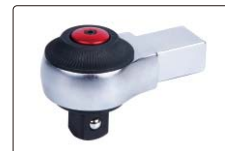
ratchet head (included)