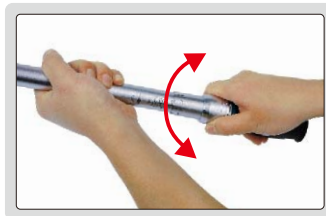
step 2: set