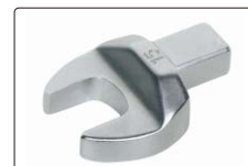
open end head (included)