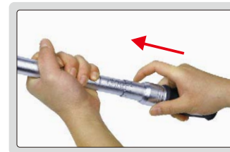
step 3: lock