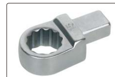
box end head (included, only for IST-8WM10, IST-8WM20, IST-8WM60)