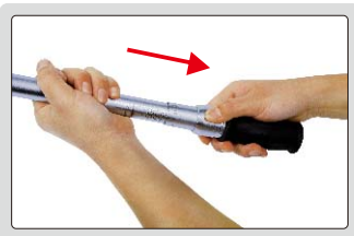
step 1: unlock