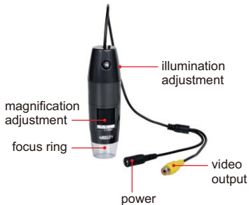
ISM-TV200 (with wire)