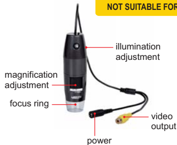
ISM-TV200 (with wire)

ATTENTION: NOT FOR MEASUREMENT, NOT SUITABLE FOR COMPUTERS