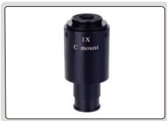
1X camera adapter (optional)