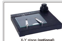
X-Y stage (optional) (X-Y travel: 74×60mm)