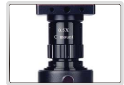
0.5X camera adapter (included)