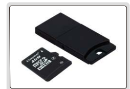
4G memory card and holder (included)