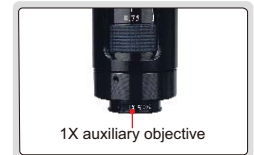
1X auxiliary objective (included)