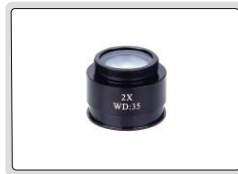
2X auxiliary objective (optional)