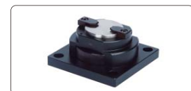
slice holder (included)