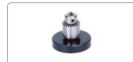
cylinder holder (included)