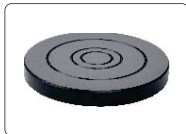
Ø150mm flat anvil (included)