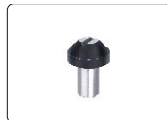
small V-type anvil (optional) for cylinders with diameter Ø2~4mm