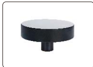
Ø63mm flat anvil (included)