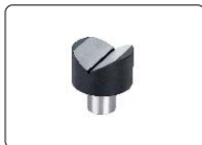
V-type anvil (included) for cylinders with diameter Ø4~60mm