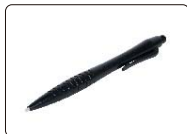
touch pen (included)