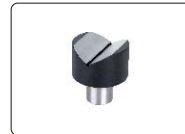
V-type anvil (included) for cylinders with diameter Ø4~60mm