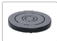
Ø150mm flat anvil (included)