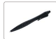
touch pen (included)