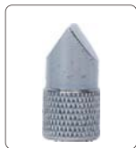
knife-edge push tip (included)