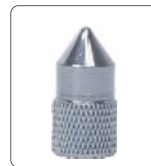
point push tip(included)