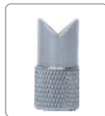
V type push tip(included)