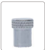
flat push tip(included)