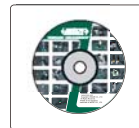
software CD (included)