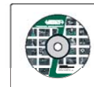
software CD (included)