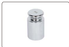
calibration weight (included in 8301-300, 8301-600 and 8301-1200 )