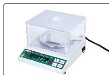
windshield (included in 8301-300, 8301-600 and 8301-1200 )