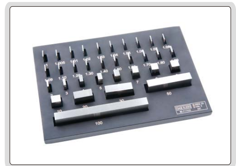
gage blocks (included)