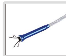
4 retractable claws