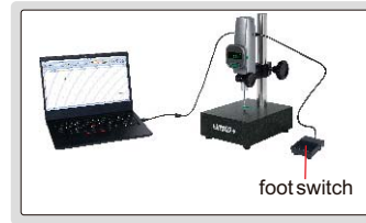
data transmitted to Excel without software