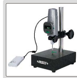
power supplied by charge pal