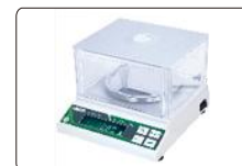
windshield (included in 8301-300, 8301-600 and 8301-1200)