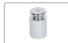
calibration weight (included in 8301-300, 8301-600 and 8301-1200)