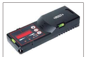
outdoor detector ( optional )