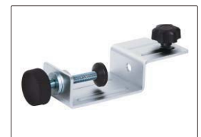
stand (included with outdoor detector)

* Use high accuracy detection mode within 15m, use low accuracy detection mode over 15m